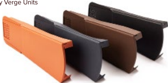
Dry Verge Units