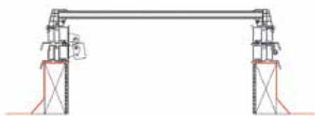
Electric opening to fit to builder's upstand