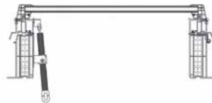
Manual opening with 150mm vertical upstand