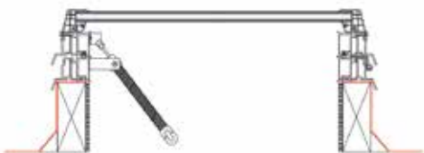
Manual opening to fit to builder's upstand